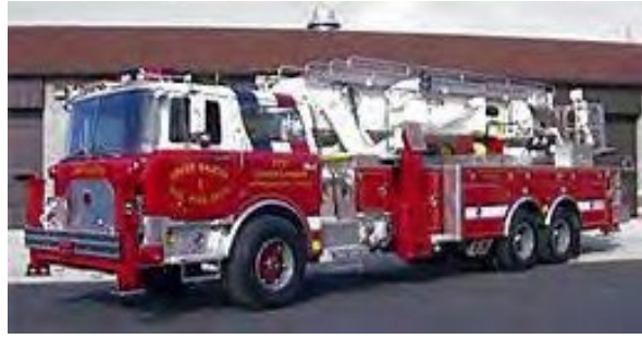
Local Fire Department